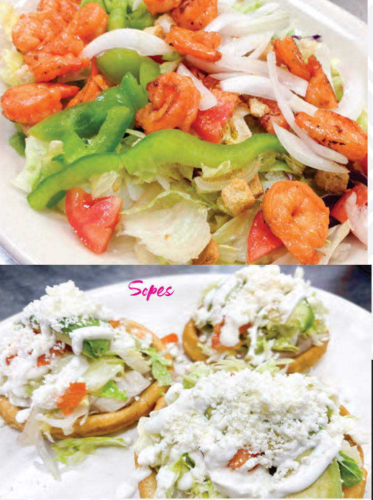
*THESE ITEMS MAY BE SERVED RAW OR UNDERCOOKED CONSUMING RAW OR UNDERCOOKED MEATS, POULTRY, SEAFOOD, SHELLFISH OR EGGS, MAY INCREASE YOUR RISK OF FOOD BORNE ILLNESS.