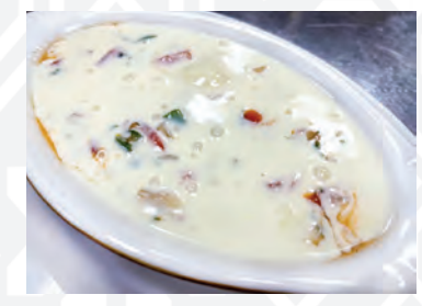
Pico Cheese Dip